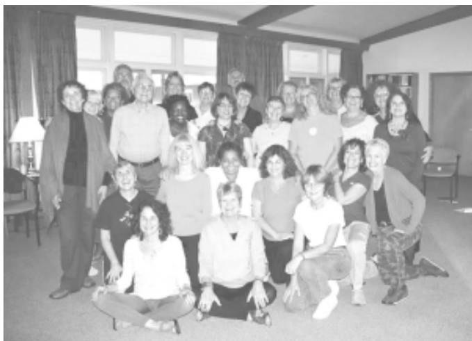
Happy campers at the third annual Unity retreat.